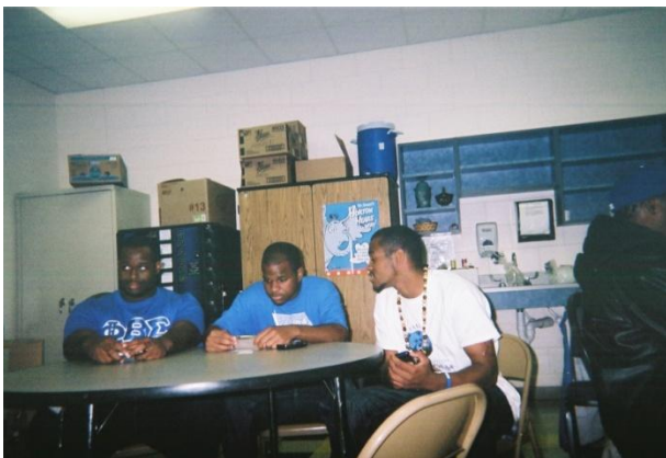
Brothers fellowship before the Teachers Appreciation Luncheon