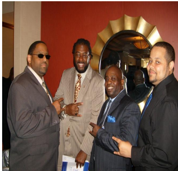
Members of the Gamma Upsilon Sigma chapter fellowship during the Leadership Conference