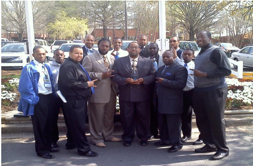
Members of the Gamma Upsilon Sigma chapter and the Lumberton Sigma Beta Club