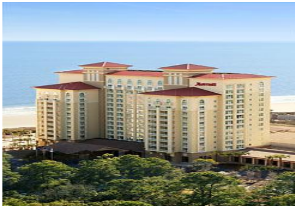
Myrtle Beach Marriott Resort and Spa at Grande Dunes