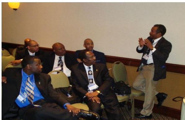
Brothers preparing for the Chapter Advisors Workshop