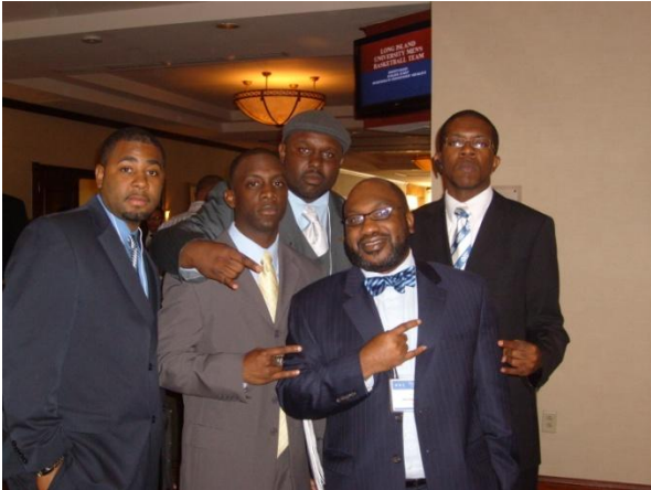
Members of Omicron Lambda Sigma chapter fellowship during the conference.