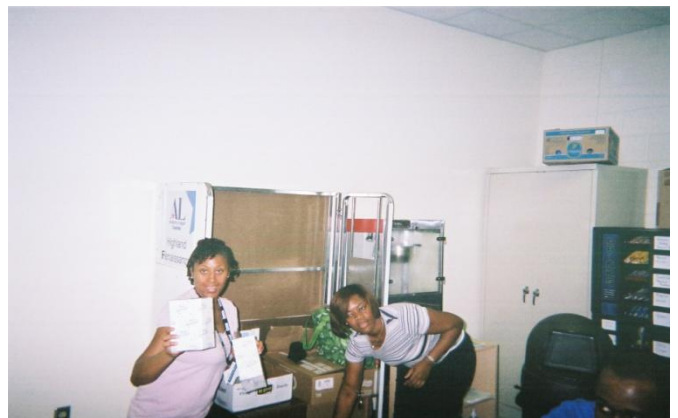
Highland Renaissance teachers fellowship with the brothers during the Teachers Appreciation Luncheon