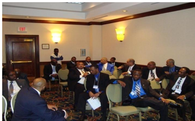
Brothers participating in the Chapter Advisors Workshop