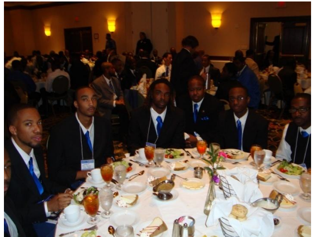
Members of the Delta Alpha chapter, Winston-Salem, NC fellowship during the Leadership Luncheon