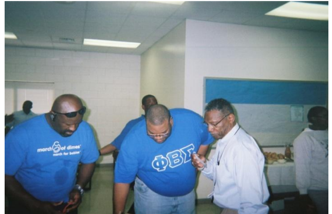
Brothers preparing for the Teachers Appreciation Luncheon after a hard morning's work